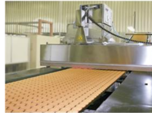
Baking color monitoring after the oven