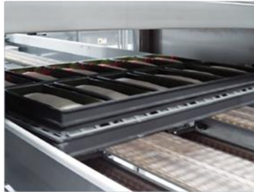
3D profile control after the proofer