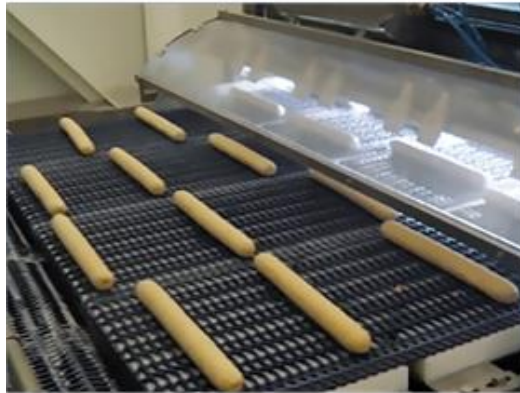
Size & shape check after forming